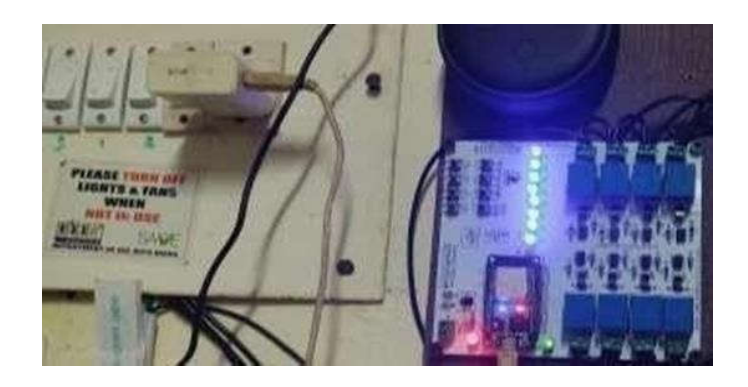
Fig (4) Manual operating