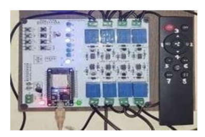
Fig (3) Remote controlling