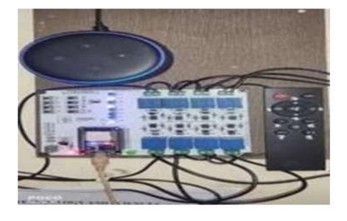
Fig (2) Alexa operating devices